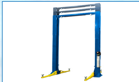
ADJUSTABLE HEIGHT EXTENSION

Heavy-duty two-stage front and rear arms facilitate easy symmetric lifting across a wide range of vehicles.