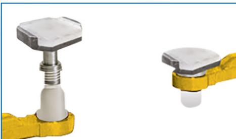
ADJUSTABLE URETHANE SCREW PADS

The safety shut-off bar prevents damage to the upper part of a vehicle by promptly stopping the lift's operation upon contact.